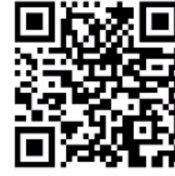
2024 Climate Change in Colorado Report