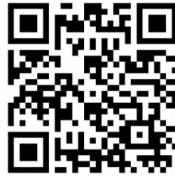
Updated 2024 Exploratory Turf Analysis